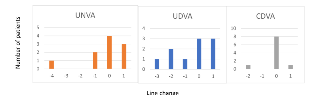
Figure 2: Visual Acuity Line Changes (Line Change) for UDVA, UNVA, and CDVA. Abbreviations: UDVA: Uncorrected Distance Visual Acuity; UNVA: Uncorrected Near Visual Acuity; CDVA: Corrected Distance Visual Acuity